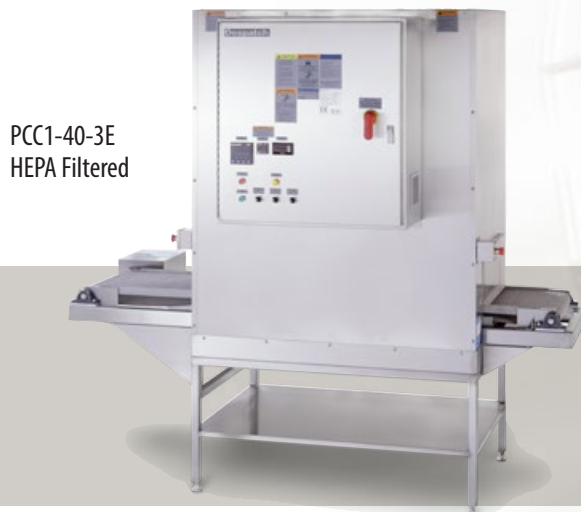
PCC1-40-3E HEPA Filtered