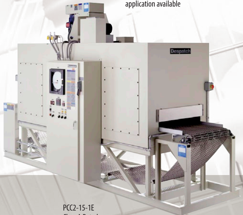
PCC2-15-1E Class A Rated