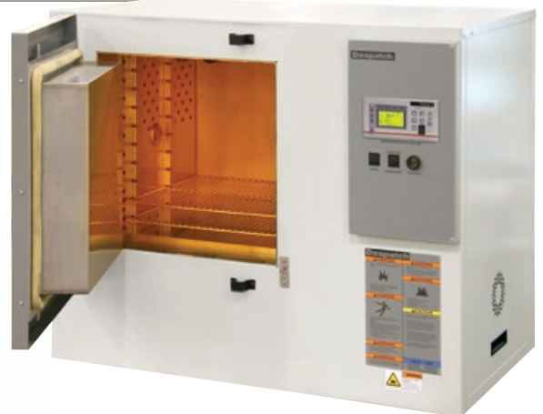
RAD1-42 benchtop oven

*50 hertz electrical is available on all models