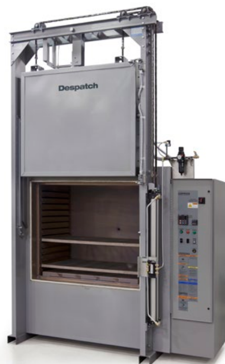
RFF2-35 with optional pneumatic lift door